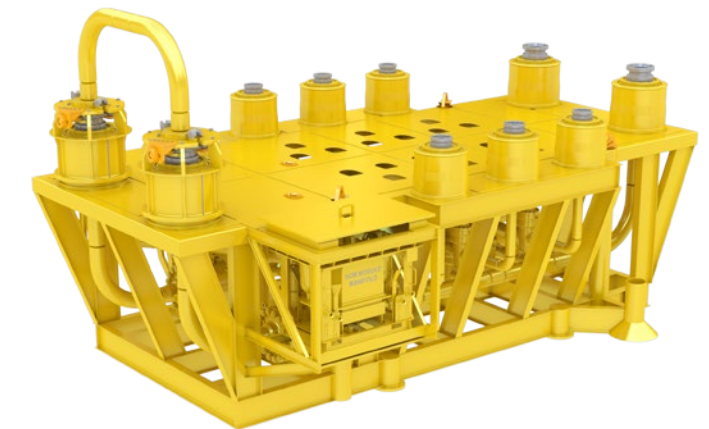
Six-slot dual-header manifold assembly with gas lift.