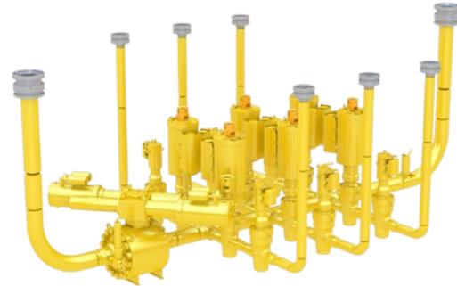
Six-slot single-header manifold.