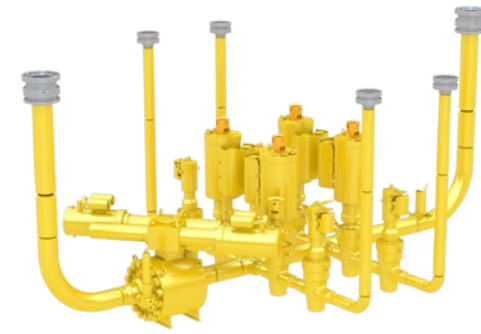
Four-slot single-header manifold.