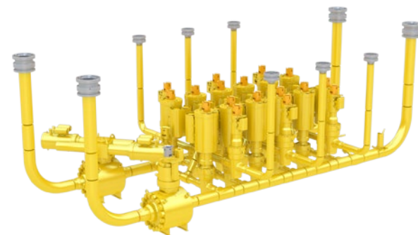
Six-slot dual-header manifold with gas lift.