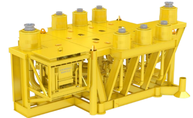
Six-slot single-header manifold assembly.